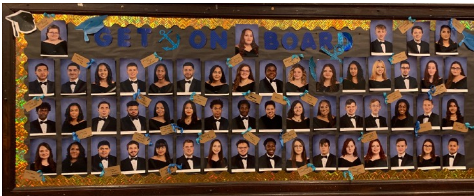
Seniors share what they'll miss most about MACS.